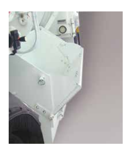
Optional Expandable Loading Hopper For yard waste/bulk items

Contact us to schedule on-site demonstrations on your routes.